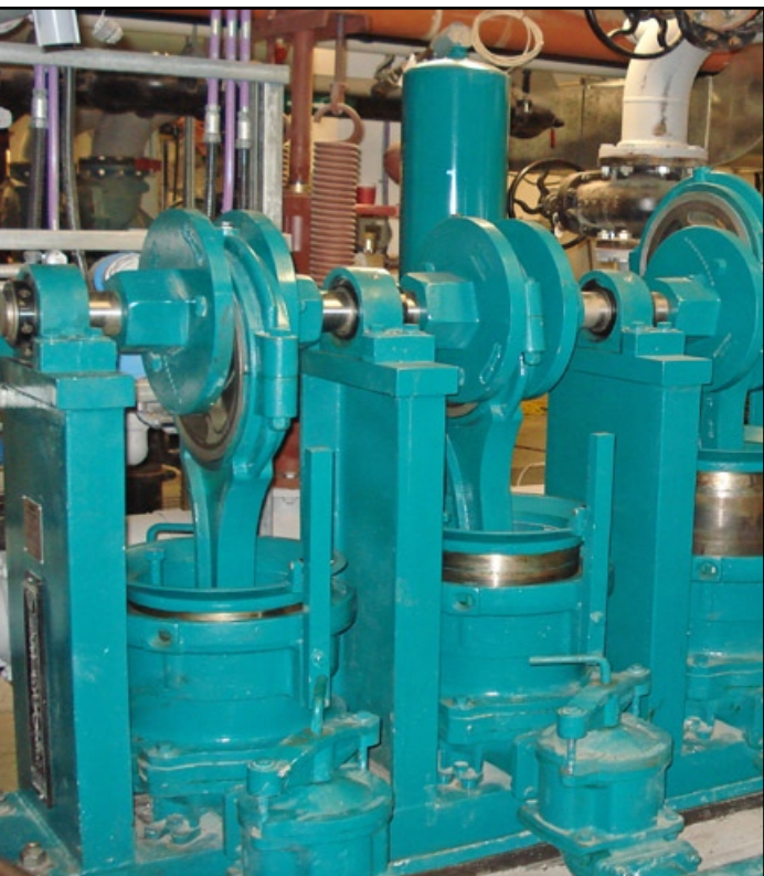
The guided stuffing box assembly is increasingly specified by Consulting Engineers for new plunger pump projects like this one at a wastewater treatment plant upgrade.

Wastecorp also employs full length guide bar rollers that capture the entire stroke length of the plunger. Tolerances are set to Wastecorp's 0.0015" nom. No lubrication is required, allowing the rollers to last up to 200 times longer than conventional guide shoes and greatly extending packing and plunger life.